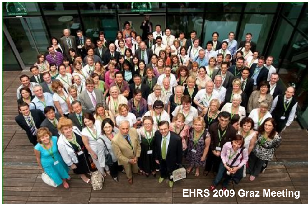
EHRS 2009 Graz Meeting